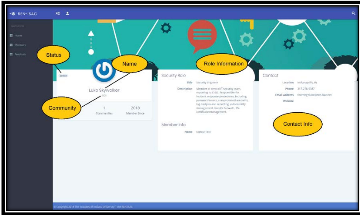
Figure 2. Highlights of Viewing a Member Rep's Profile

To view other institutions, click the “Members” link in the navigation menu at the left side of the screen. This will display a list of all REN-ISAC member institutions. The columns are all sortable, and there are options to filter and change the number of entries displayed (see Figure 3 below).